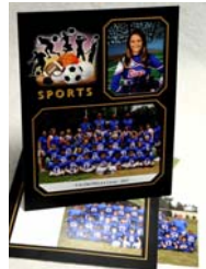
Memory Mate Frame: Team & indiv photos in color cardboard easel frame.