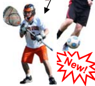
Shadowbox Frame Matte and photo for signatures.