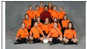
U112 Girls Attack—2009