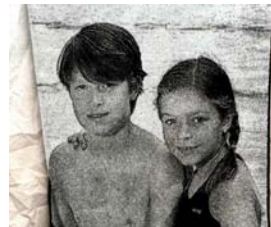
30x60" Beach Towel