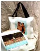
15" Canvas Tote