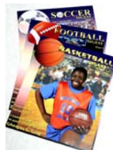
Sports Magazine Covers