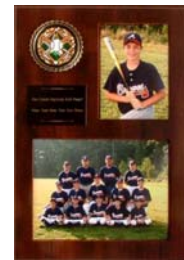
Medallion Plaque: Solid wood, cherry veneer, 5x7 team & 3x5 indiv photos, free engraving