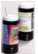
Water Bottle: Photo, name, year