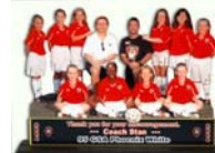
Team Cut-Out Statue With engraved base plate.