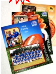
Digital Memory Mates: Team & indiv photo in 8x10 print with name/year/team!