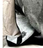
30x60" Beach Towel