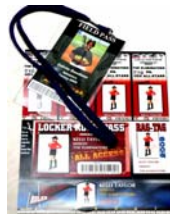
All Star Pack: Game tickets, ruler, VIP Pass with lanyard.