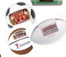
Full Size Signature Balls Perfect for team gifts!