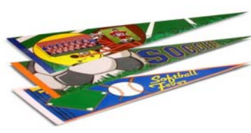
Sports Pennants: All sports available, includes 5x7 team and 3x5 indiv photos.