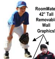
RoomMates 42" Tall Removable Wall Graphics!