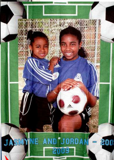
50x60" Fleece Throw: Great for cool game nights. All sports.