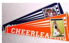
15" Cheer Frame Orange, black, royal, with photo