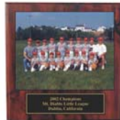
Wood Coach/Sponsor Plaques