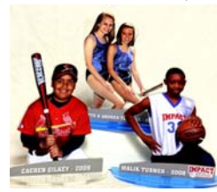
Cut-out Statues with name plate base.