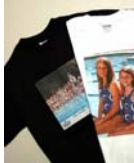
100% Cotton Tees