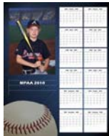
8x10 Photo Calendar 12 mo, Sport specific